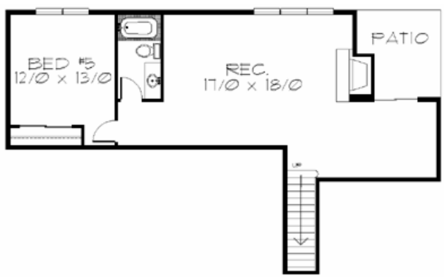
P lan M-2808 50/0 wide x 41/0 deep 2,808 sq. ft.