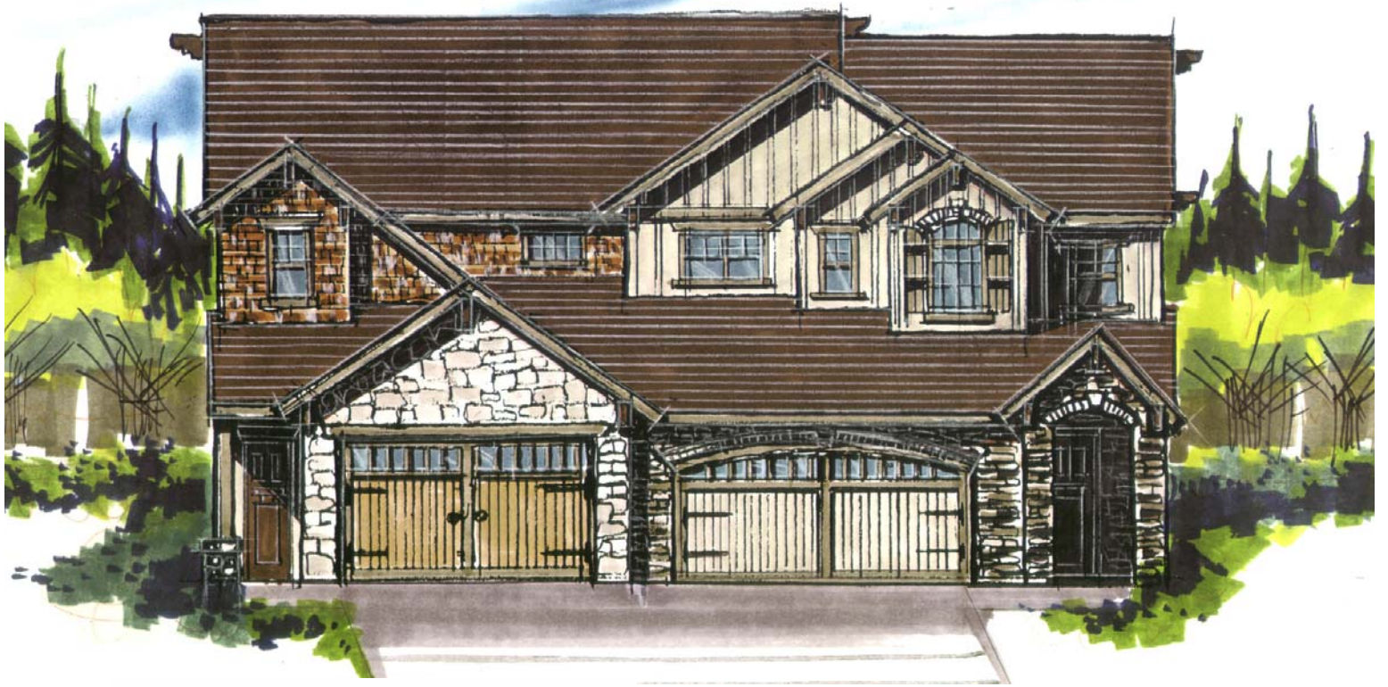
Unit 1 Main 731 Sq. Ft.